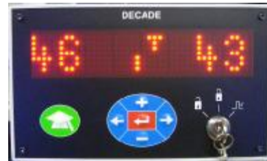
DLM Teach Mode Display.