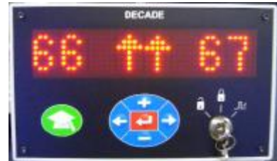
DLM Overload Fault Display.

This can be used to turn off the min and max limits while tool setting for example. The Press Capacity Limit is still checked though.