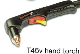
T45v hand torch