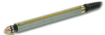
T45m machine torch