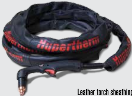
Leather torch sheathing