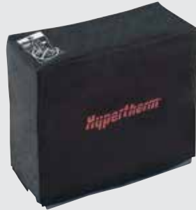
System dust cover