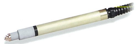
T80M machine torch