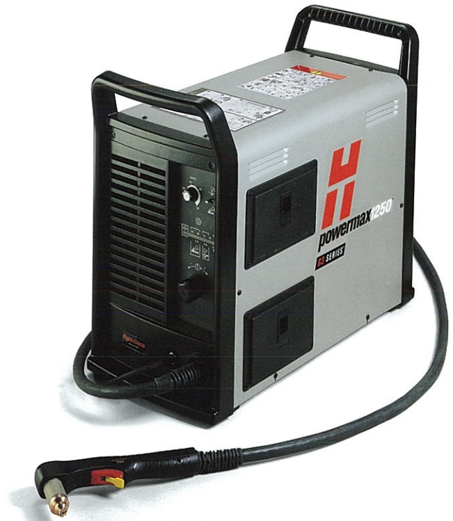
T80 hand torch