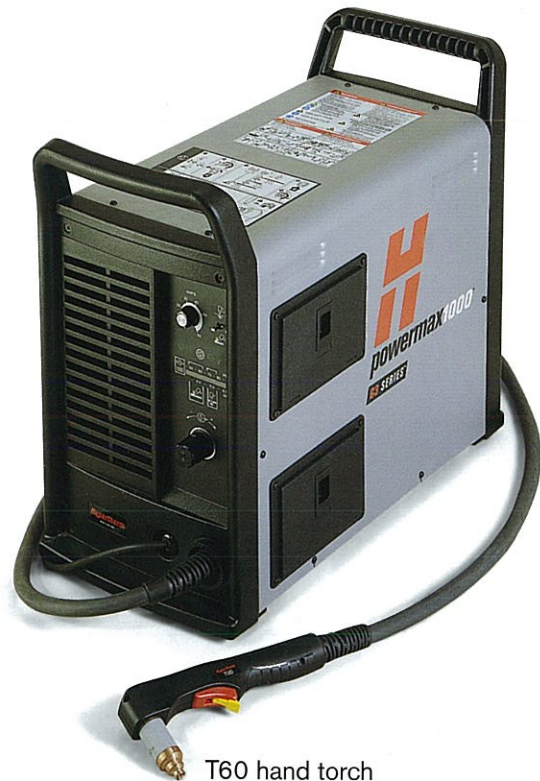
T60 hand torch