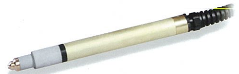
T60M machine torch