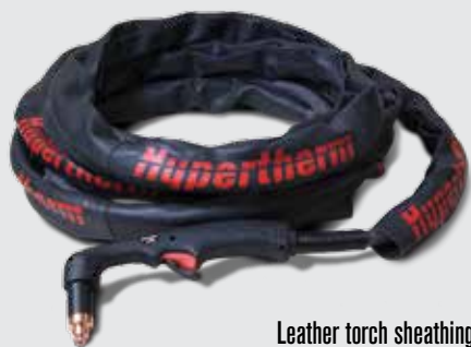
Leather torch sheathing