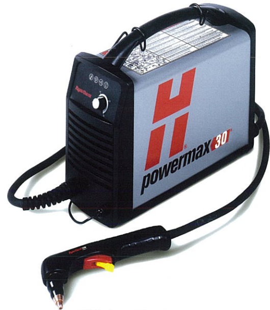
T30v hand torch